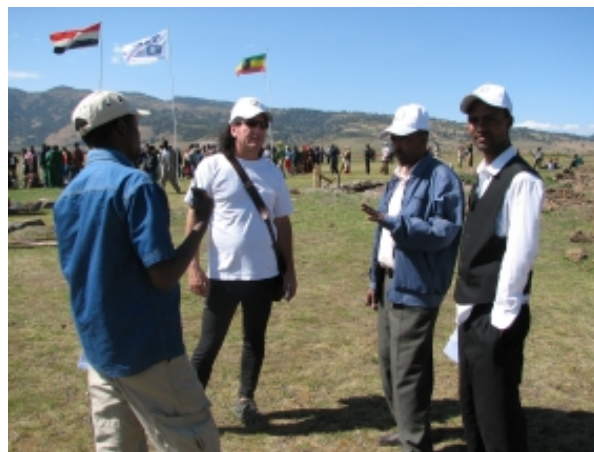
Wolf Day in Dinsho: (right to left) EWCP Education Officer, Project Manager and Director

Individuals in the technical areas of monitoring, veterinary intervention and education receive continuous upgrading of their skills. This year the monitoring team were introduced to the important technique of Distance Sampling while the vet team were involved in the testing of oral vaccination (discussed below). We provide continuous building of skills in English, report writing and computer competence. Former members of our staff have gone on to take responsible jobs in other organizations.