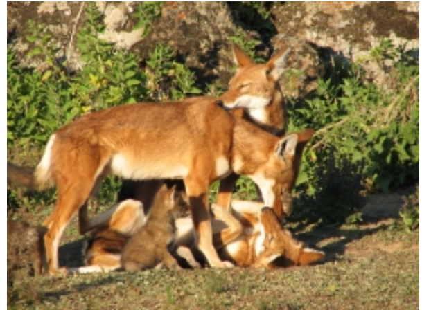
Pack members greeting