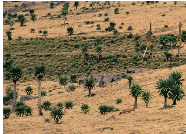
Spot the wolf...

EWCP's recent extension to the Arsi Mountains also opens important opportunities in the future. The Arsi Mountains are second only to Bale in the size of the wolf population and the area of suitable habitat. They also support a small number of mountain nyala and several of the endemic mammals also found in Bale. In comparison, there is less permanent human settlement in the Afroalpine areas of Arsi and a strong administrative structure committed to conservation (although with almost no funding at the moment).