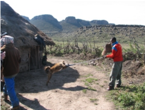
Vaccinating dogs in villages around the Web Valley

began nine years ago. Discussions with the EWCP Coordination Group in Oxford last year concluded that the team should focus more tightly on villages in or very close to the wolf range, thus reducing the total number of dogs to vaccinate. Dog owners in towns still bring their dogs to our team.