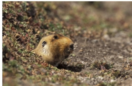
Giant molerat, the wolves' main prey in Bale

Yaba looked at the diet of the giant molerat ( Tachyoryctes macrocephalus ) which is restricted to the Afroalpine grasslands of the Bale Mountains. Both species are important prey for Ethiopian wolves, and knowledge of the herbivore community is important for understanding the population biology of wolves.