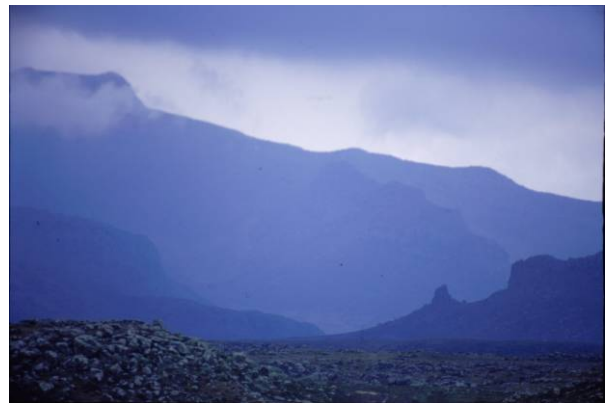
Bale Mountains National Park

with the Bale Mountains National Park (BMNP) and has created an ambitious Management Plan for the park. They have employed their own staff of ecological monitors. At the same time a consortium of European nations has provided a grant of US$6,000,000 to work with communities around the park to promote sustainable development. The EWCP looks forward to working as an integral part of the larger conservation effort in Bale (plans for this discussed in the Prospects section below).