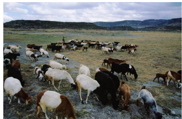
Sheep flocks in the Web Valley

This year farmers again tried to plough parts of the Web Valley. Although Ethiopian wolves can coexist with livestock, the habitat is permanently degraded by agriculture. Potatoes have become a very popular crop over the last ten years and can be planted at elevations higher than that of Web Valley.