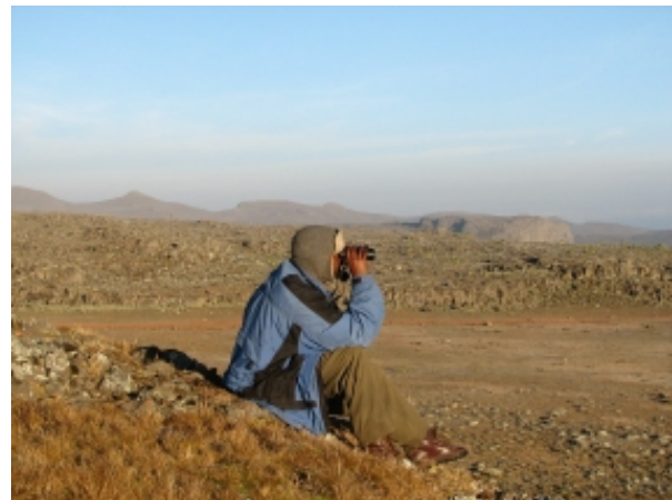
Field monitor from Dinsho, Bale

inviting them to a meal. They express enthusiasm and support for EWCP but there are some tensions between their mandate and the objectives of the park.