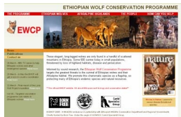
EWCP website www.ethiopianwolf.org