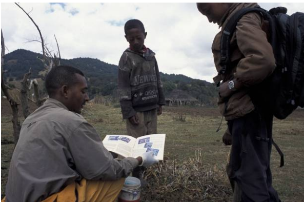
Vet Officer explaining about the risk of rabies during a dog vaccination campaign

The education campaign also reached to the adult population, during field trips, explaining the role of EWCP and its dog vaccination activities.